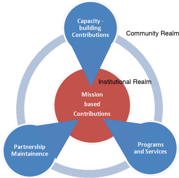
Figure 1. Higher Education Contribution Model for the Promise Neighborhoods

This research also has implications from the practical perspective of neighborhoods implementing a comprehensive community initiative. First, if considering an education-based initiative, it is evidenced in the partnership proposals just by the number of institutions and the diverse roles they play that higher education institutions are perceived as pivotal partners in comprehensive community partnerships for education. Although they need not be central to the partnership, they can serve several functions to streamline a “continuum of solutions,” such as the efforts of community-based partnership. Higher education institutions demonstrate potential capacities to administer community-based programs and community-focused grants; they can smooth transitions through the education pipeline.