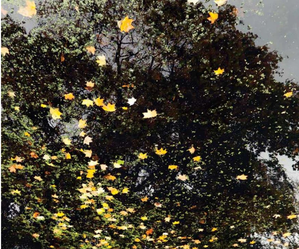
“STORM FORCE”

Created on Thursday, 25 October 2012 16:23